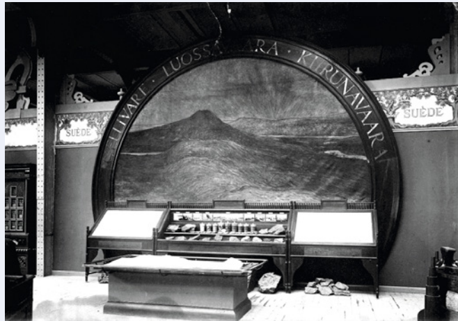
Fig 1. Unknown photographer, Luossavaara-Kiirunavaara Aktiebolag Display at Paris Exposition Universelle, 1900, photograph, dimensions unknown, Kiruna Bildarkiv, Kiruna.

so-called “Golden Age” of Nordic art, with a focus on delineating the cultural specificities of art in each country. 7 But a dark absence and flagrant irony loom over Karl Nordström’s Kiruna and the National Romantic ideology behind works of Nordic “primitivism.” To portray Kiirunavaara as “untouched” enacts a dangerous colonialist discourse of indigenous erasure. Sweden’s northern climes might have appeared vast, unending, and powerful, but they were never uninhabited. Sápmi, the northernmost areas of Norway, Sweden, Finland, and Russia’s Kola Peninsula, has been home to the indigenous Sámi for centuries. 8