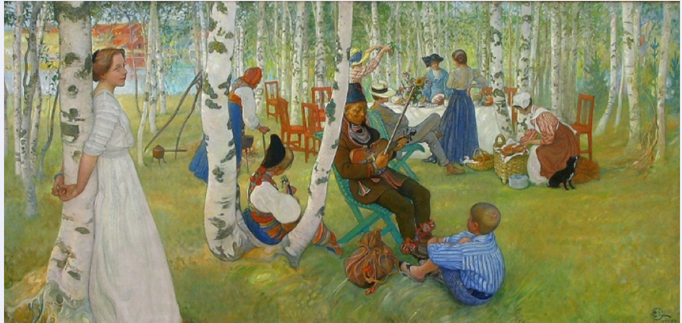
Fig 6. Carl Larsson, Breakfast in the Open, 1910-1913, oil on canvas, Norrköpings Konstmuseum.